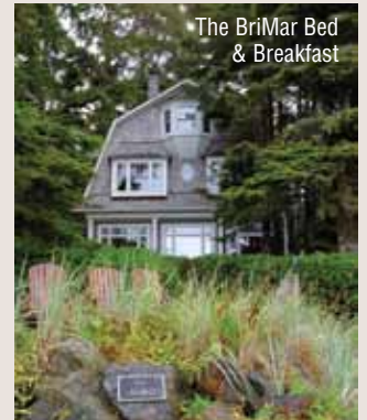
The BriMar Bed & Breakfast

The BriMar Bed & Breakfast offers a welcoming stay on the shores of South Chesterman Beach. All rooms have ocean views; breakfast is hearty and delicious. From $149. brimarbb.com