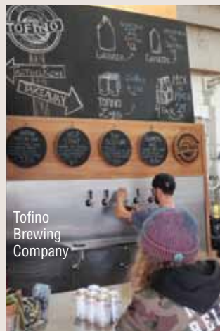
Tofino Brewing Company

meats for your winter picnic. picniccharcuterie.com